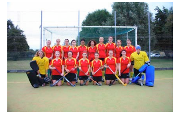
Inter-Island Women's tournament